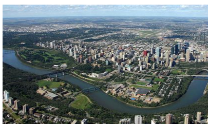
North Saskatchewan River