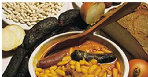
>>FOOD Fabarda española

You can find approx. 10 min. from BOTASKI at Seseña or Aranjuez many Restaurants. Besides them you can find big gastronomy offer in Toledo or Madrid, both of them 30 min. from the lake.