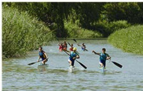
>>ARANJUEZ Kayaking on the river