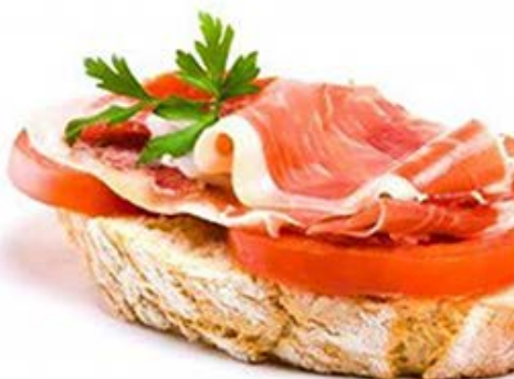
>>FOOD Tapas Food