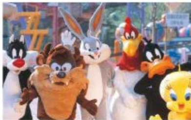
>>MADRID Warner Bros