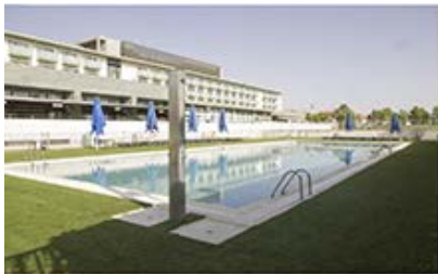
>>OCCIDENTAL HOTEL Outdoor pool