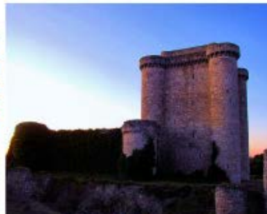
>>SEÑA Castle Puñonrostro