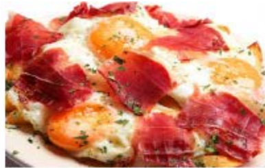
>>MADRID Tapas Food