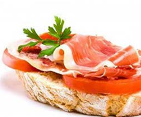
>>FOOD Tapas Food