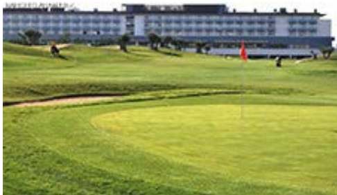
>>ARANJUEZ View of the Golf Course