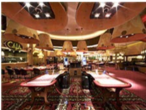
>>ARANJUEZ Gran Casino Aranjuez

And if at the end of the day you want to spend some time gambling, you will find in Aranjuez the Gran Casino .