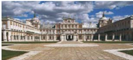
>>ARANJUEZ Royal Palace