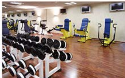
>>OCCIDENTAL HOTEL Gym