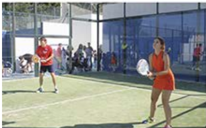
>>OCCIDENTAL HOTEL Padel Court