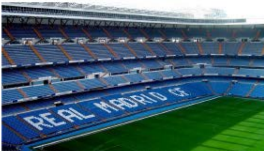
>>MADRID Real Madrid Stadium