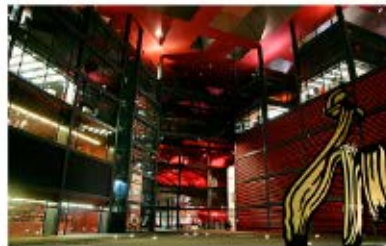
>>MADRID Reina Sofia Museum