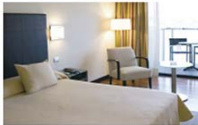
>>OCCIDENTAL HOTEL Bedroom