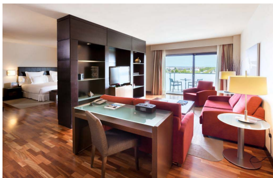
>>OCCIDENTAL HOTEL Bedroom