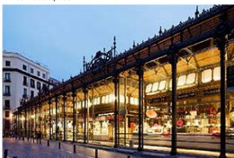
>>FOOD Wonderful Market in the center of Madrid