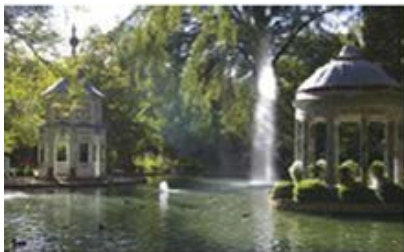
>>ARANJUEZ Royal Palace Gardens