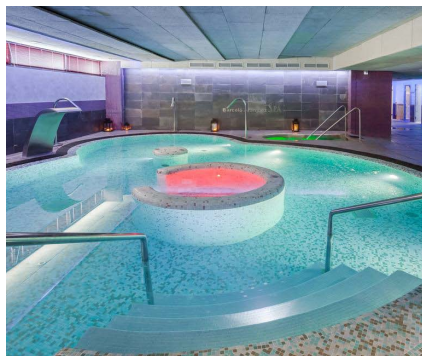
>>OCCIDENTAL HOTEL Spa area