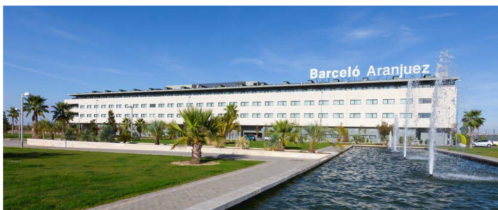
>>OCCIDENTAL HOTEL The Hotel

Credit Cards accepted: Visa, MasterCard, American Express and Eurocard .