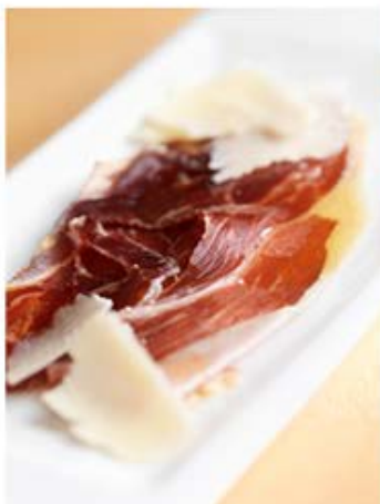
>>FOOD Tapas Food