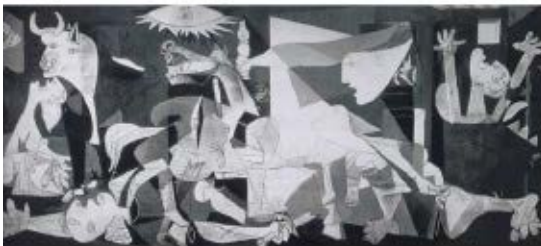
>>MADRID Guernica. Picasso