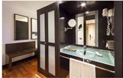
>>OCCIDENTAL HOTEL Bedroom