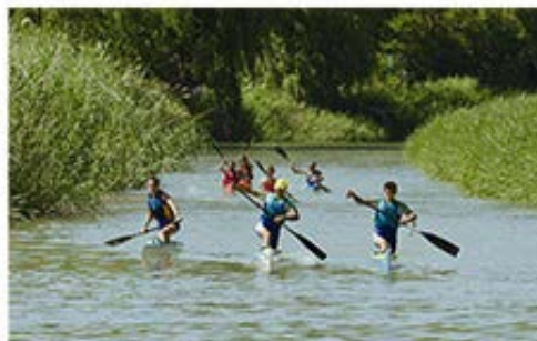
>>ARANJUEZ Kayaking on the river