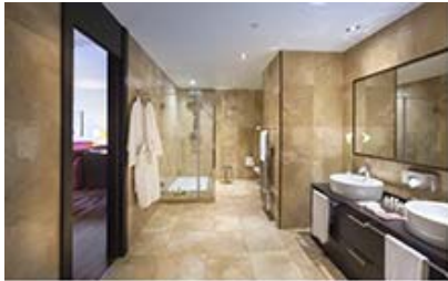
>>OCCIDENTAL HOTEL Bedroom