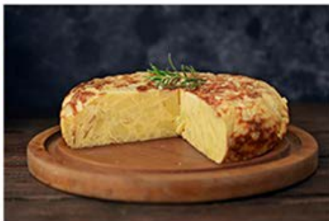
>>FOOD Tortilla española