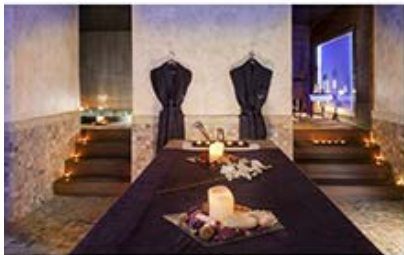
>>OCCIDENTAL HOTEL Massage area