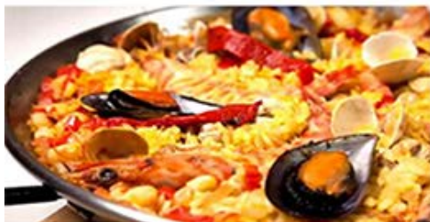
>>FOOD Paella española