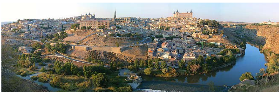
>>TOLEDO Panoramic View of the town